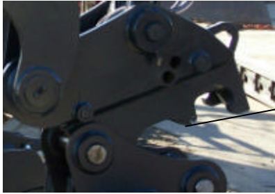
Hydraulic Multi-Pin Grabber Coupler (Shown coupling to bucket)